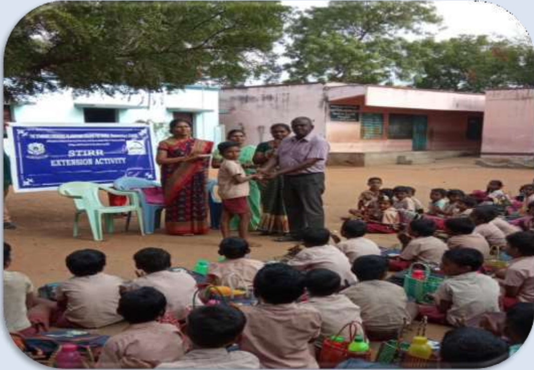
Free Tuition Service at AVT School, Sivakasi – Sosical Service League