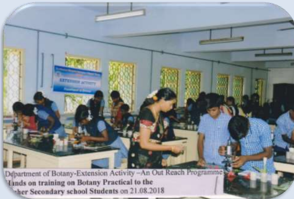
Department of Botany-Extension Activity –An Out Reach Programme Hands on training on Botany Practical to the Other Secondary school Students on 21.08.2018