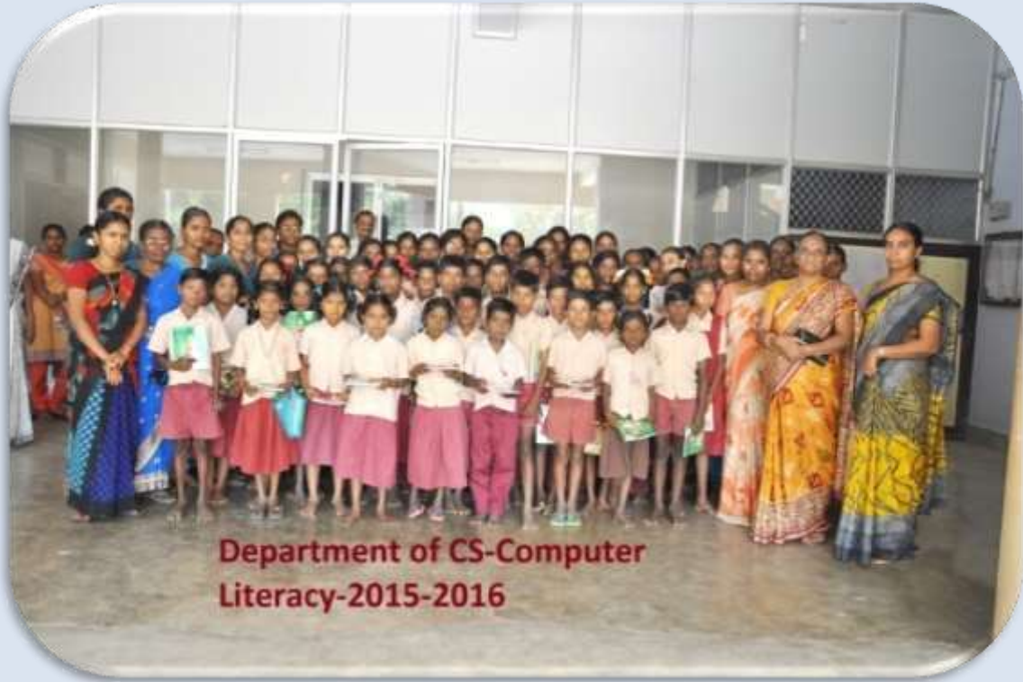
Department of CS-Computer Literacy-2015-2016