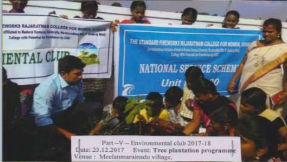
Part - V - Environmental club 2017-18 Date: 23.12.2017 Event: Tree plantation programme Venue : Meelanmarainadu village,