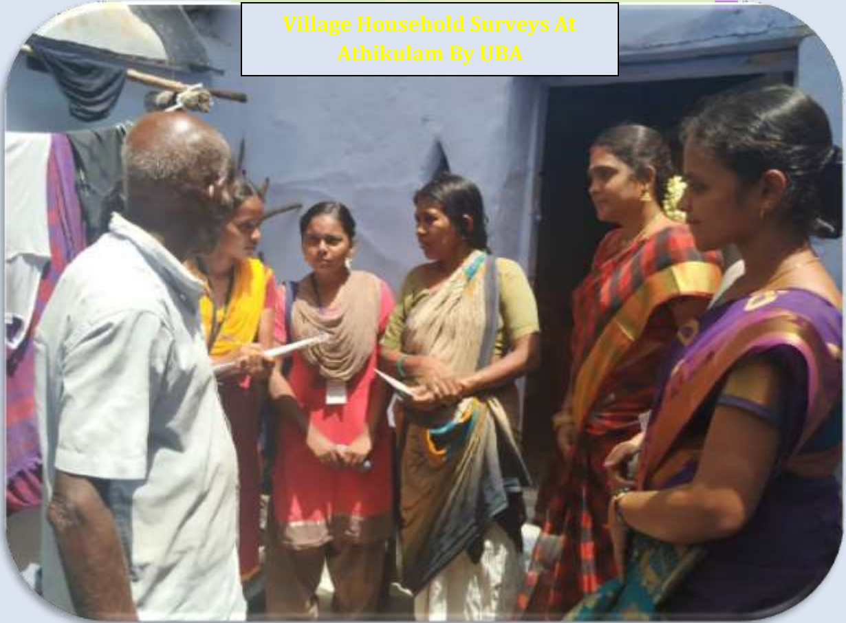
Village Household Surveys At Athikulam By UBA